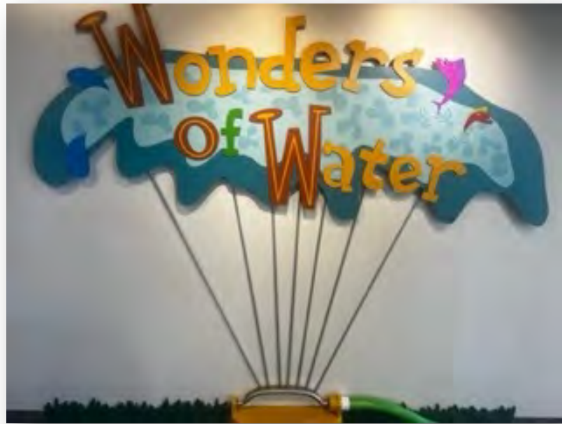
Wonders of Water